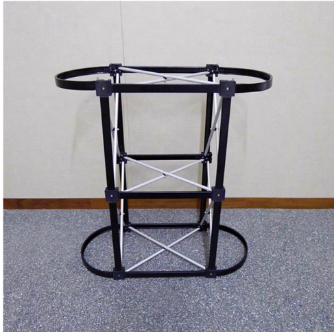
Step 4 : Insert the 4 Channel Bar (C) to 4 corner as a curved. Once all channel bars are attached, insert internal wooden shelves, resting them in place on the hubs.