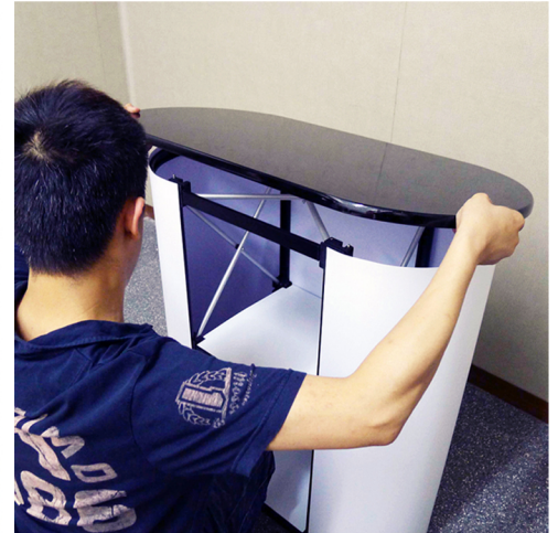
Step 6 : Rest counter top on, ensuring the holes on the underside locate with the steel pins on the hubs.