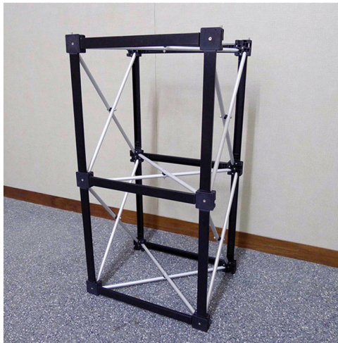
Step 2 : Insert the 8 Channel Bar (A) vertically to the front and back by slotting point end inside upper hub first.