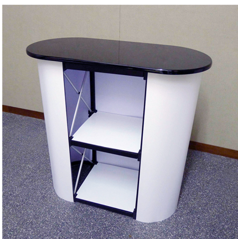
Step 7 : Insert and secure the Shelves (2) into the center of the aluminum frame.