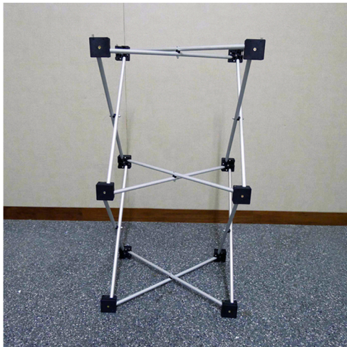
Step 1 : Expand frame keeping the hubs with steel inserts to the top.