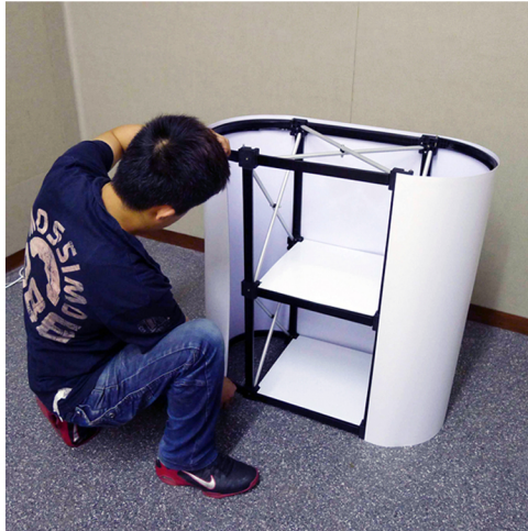
Step 5 : Attach your graphic panel. Starting from one end, keeping it level with the horizontal channel bars.