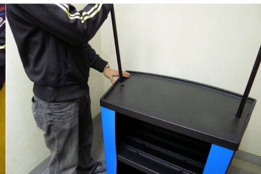
Step 9: Slot the 2nd header supporting pole to the other hole as well. (All the way down to the middle shelf unit)