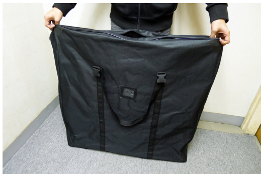
Step 1: Remove the components from the nylon bag.