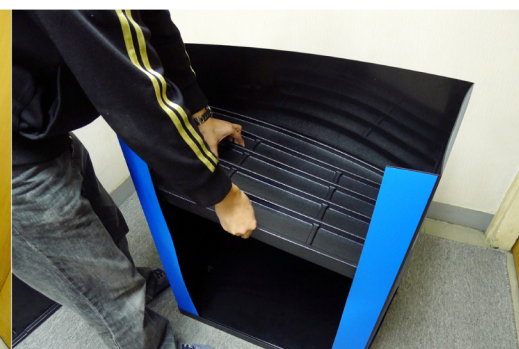
Step 6: Take the plastic shelf unit and slide down through the top of the wrap.