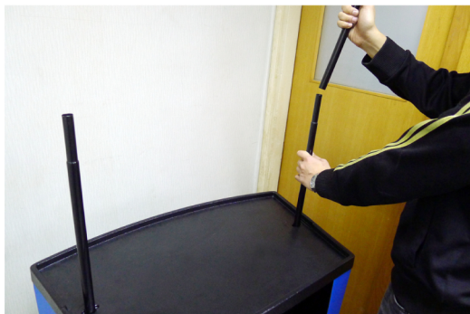
Step 10: Extend the length of the 1st pole by joining with the 3rd pole.