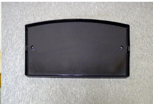
Step 2: Place one of the larger size plastic on the floor with the raw edge facing upwards.