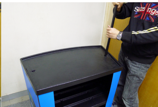
Step 8: Slot the 1st header supporting pole through the hole in the top unit. (All the way down to the middle shelf unit)