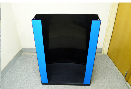
Step 5: It should now look like this.