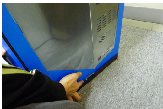
Step 4: Make sure the wrap is knocked well to the base unit into the hole on both sides.