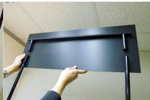
Step 12: Attach the head panel to the poles and FINISH.