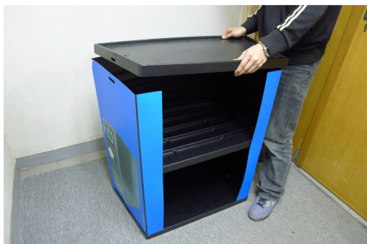
Step 7: Slot over the wrap with the remaining larger size plastic.