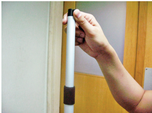
Step 3 - Extend the adjustable pole to your desired height and then twisted to tighten.