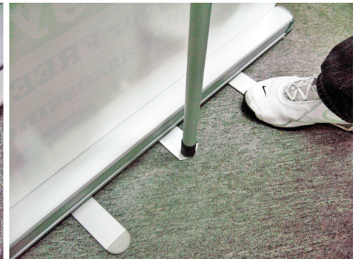
Step 5 - Stand on one feet of the base case to stabilize.