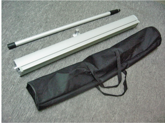
Step 1 - Remove the hardware from the bag.