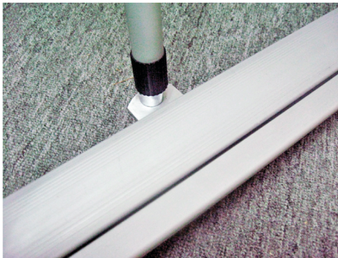
Step 4 - Insert the pole into the pole adapter.