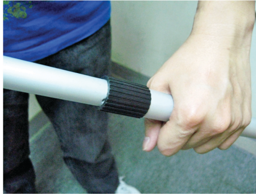
Step 2 - Extend the pole by twisting the locking system.