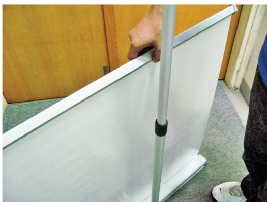
Step 6 - Raise the top profile with banner out from the base case slowly and slightly.