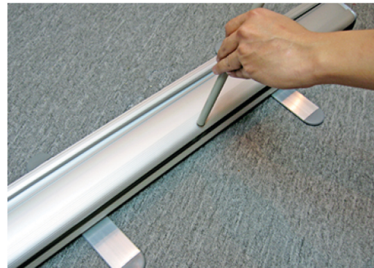
Step 4 : Insert the pole into the pole adapter (the hole) at the center of the aluminum base case. * Large size banner stand have 2 poles to insert.