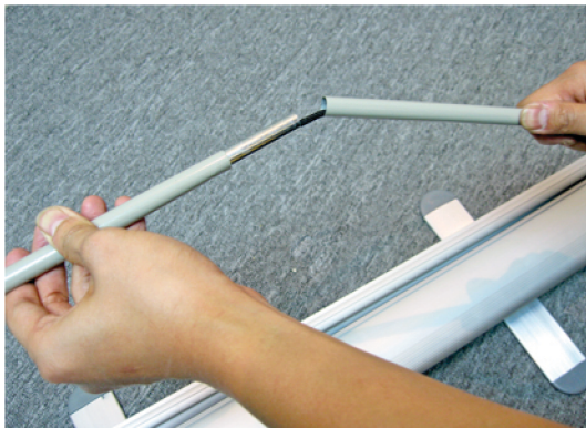
Step 3 : Assemble the three fold-poles into one unit.