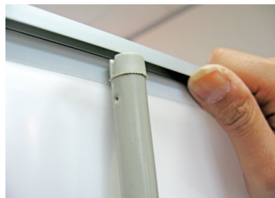
Step 6 : Continue to raise the graphics slowly and slightly until it reach the top part of the pole. Insert the tab on top of the pole into the groove on the top profile.