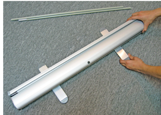
Step 2 : Rotate the stabilizing foot to 90 degrees.