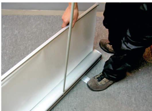
Step 5 : Stand on the foot of the base support in back to stabilize. Raise the top profile out of the base case slowly and slightly.