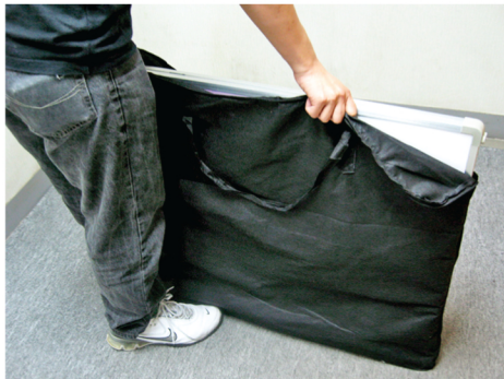
Step 1: Remove the components from the carrying bag.