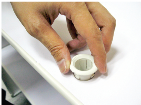
Step 5: Insert the two plastic circle rings into the two holes of the countertop completely. Insert each pole into the hole of each plastic ring from the countertop. Attach the header to the top of the poles. The counter is ready!