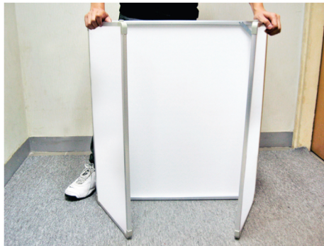
Step 2: Unfold the aluminum frame and positioning it so the sides are at 90 degree angles to the front.