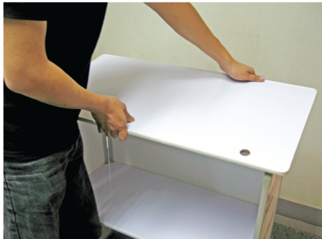
Step 4: After the shelf is installed, rest the wooden countertop on top of the aluminum frame. There are 6 holes under the wooden countertop to accommodate the countertop and the frame. Make sure the two holes on the countertop for connecting the poles are close to you. See picture as shown above.